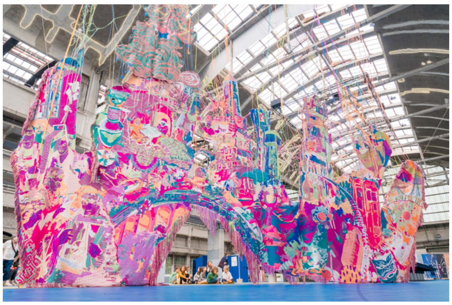
17th Lyon Biennale of Contemporary Art, Grandes Locos. Exhibition view with visitors. Mona Cara, Le Cactus , 2024, courtesy of the artist © ADAGP, Paris, 2024.

For this 17th edition, nine artists were central to 15 territorial projects in greater Lyon and the Auvergne-Rhône-Alpes region.