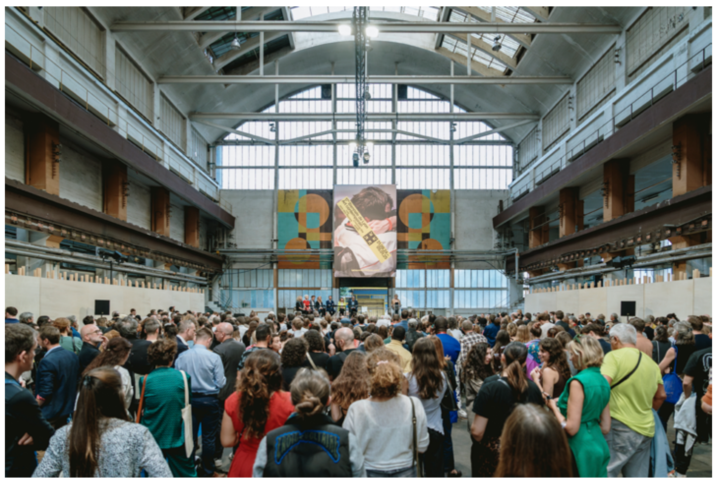
17th Lyon Biennale of Contemporary Art. Opening at Grandes Locos.

A big thank you to them all for their vital support, but also to the public for their enthusiasm!