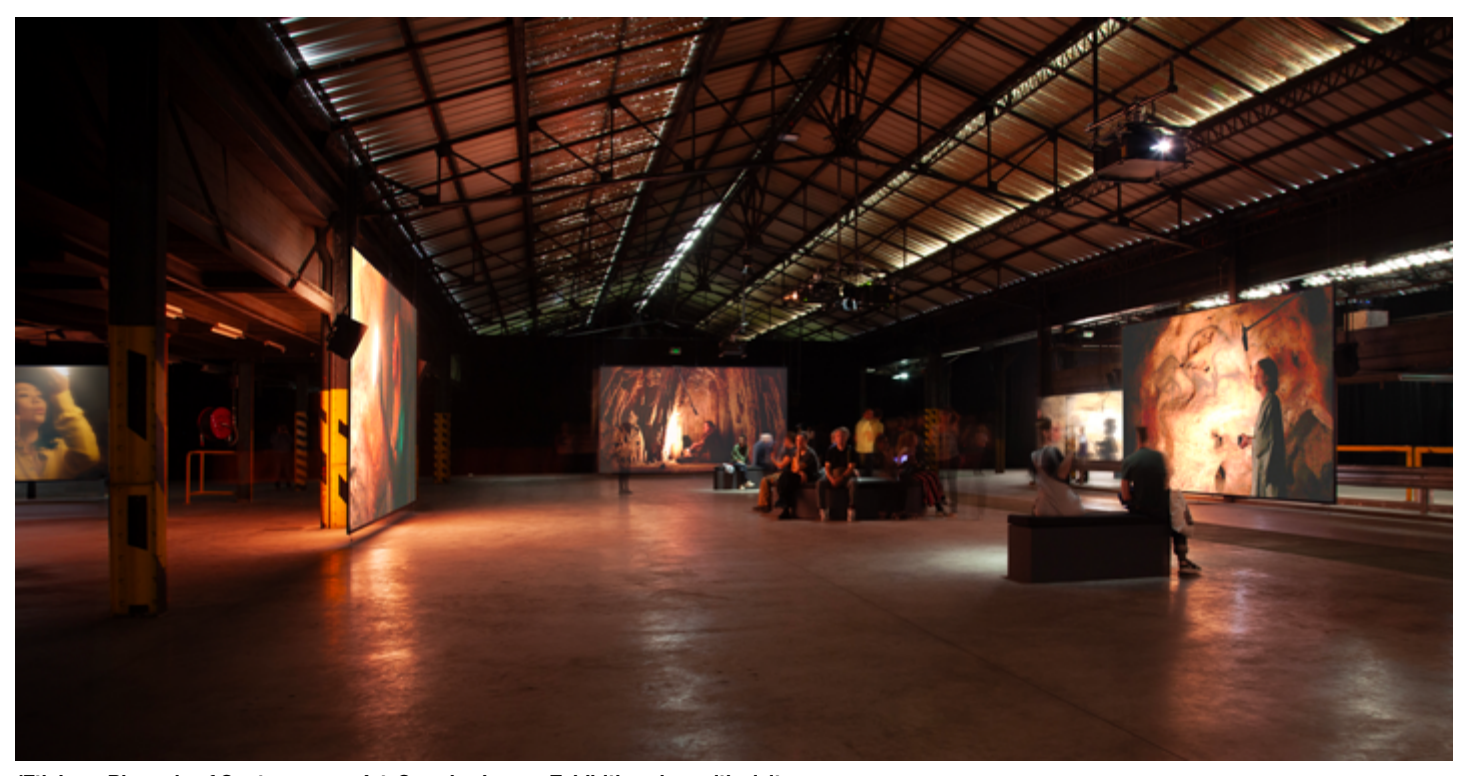
17th Lyon Biennale of Contemporary Art, Grandes Locos. Exhibition view with visitors. Oliver Beer, Resonance Project (The Cave), 2024. Courtesy of the artist and Thaddaeus Ropac and Almine Rech galleries. Photo: Oliver Beer Studio

285,000 visits to the venues (public space excluded):