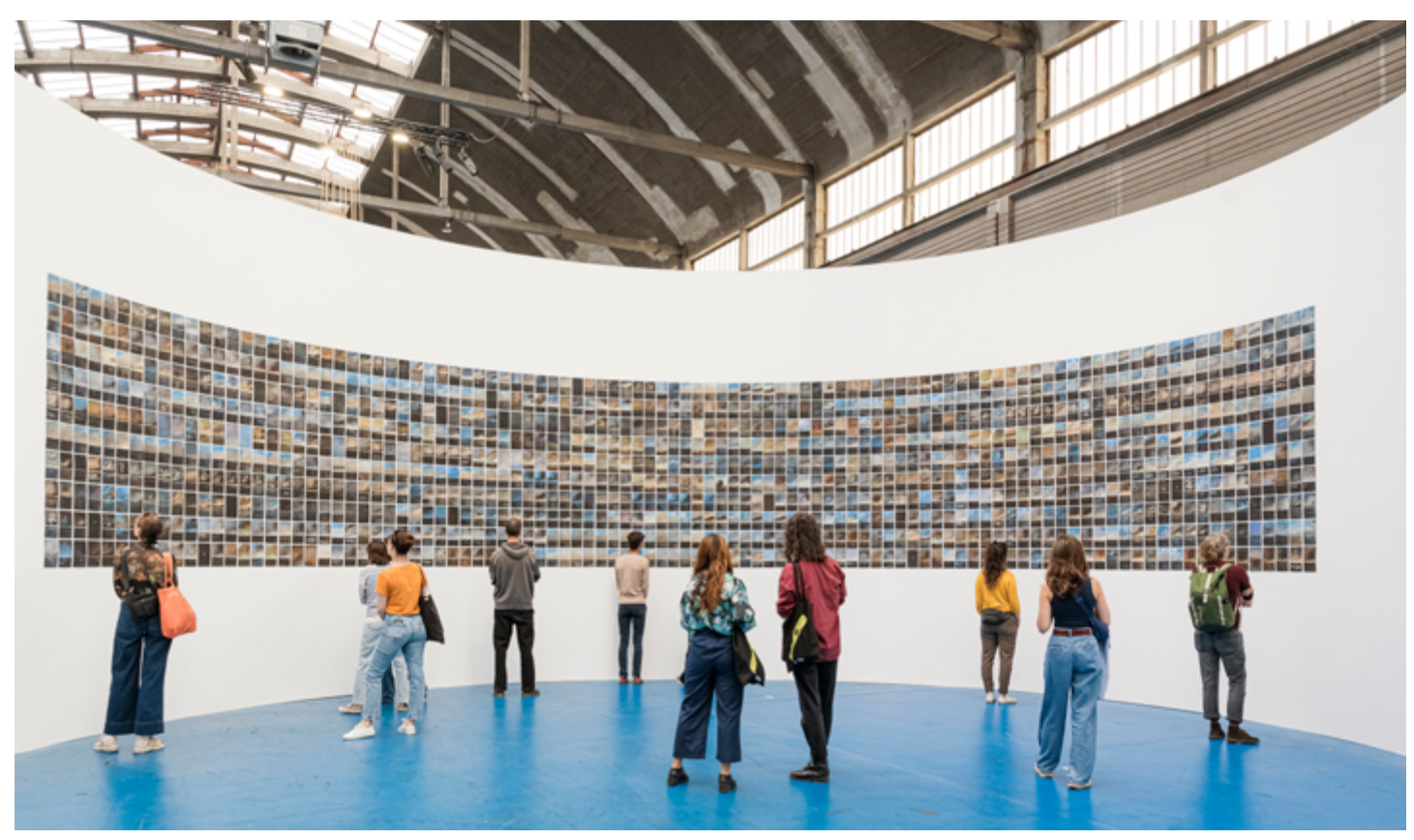
17th Lyon Biennale of Contemporary Art, Grandes Locos. Exhibition view with visitors (guided tour). Jean-Christophe Norman, « Le fleuve sans rives » Hans Henny Jahnn, 2024, courtesy of the artist and Galerie C Neuchâtel / Paris. Photo: Blandine Soulage

La Biennale de Lyon devises, produces and alternatively holds two major events: the Biennale de la danse and the Lyon Biennale of Contemporary Art.