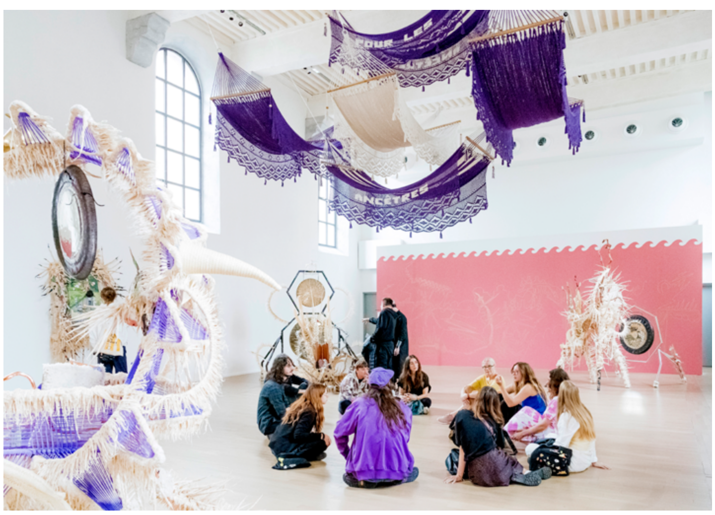
17th Lyon Biennale of Contemporary Art, Cité Internationale de la Gastronomie. Exhibition view with visitors. General view of Guadalupe Maravilla's artworks.

32,500 schoolchildren hosted 2,105 professionals accredited 3,096 guided tours